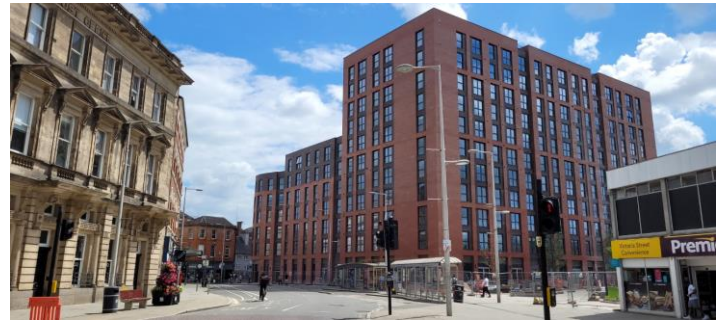
259 New Flats Victoria Street

The landlord will not permit any form of hot food takeaway.