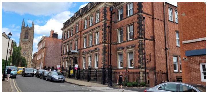
55 Luxury Apartments Middleton House St Marys Gate